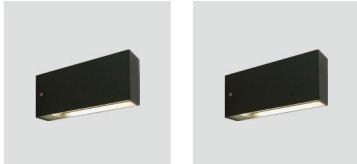
B-140 Wall Lighting: 6W. Page. 418